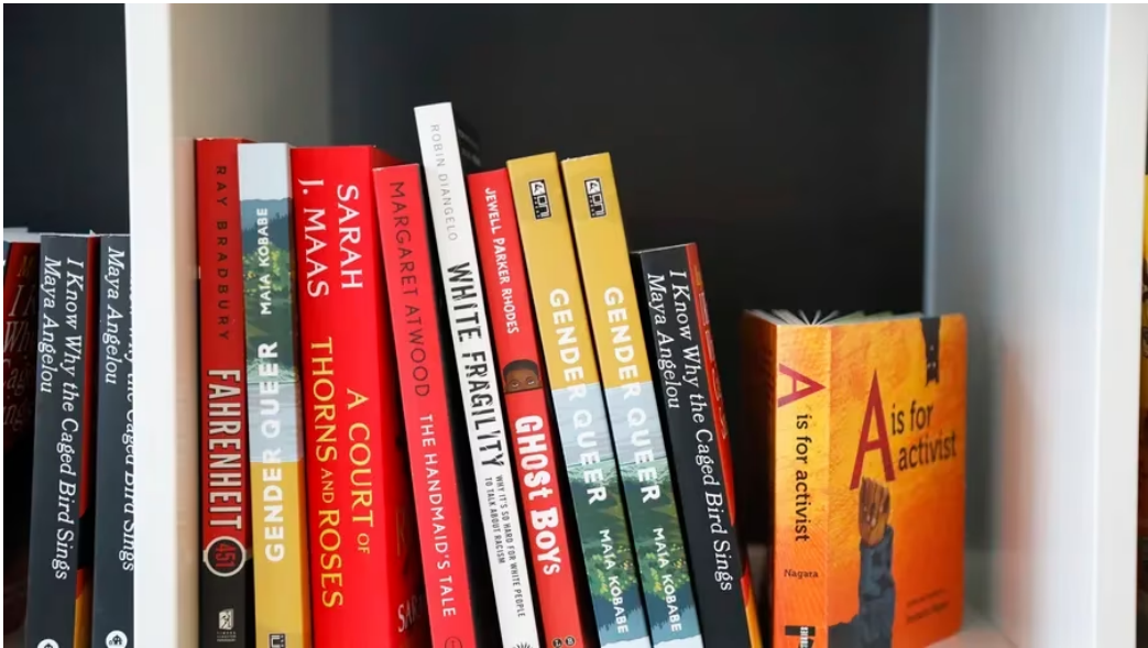
Books are displayed at the Banned Book Library at American Stage in St. Petersburg in February.